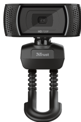
PRODUCT FRONT 1