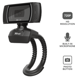
PRODUCT ESHOT 1