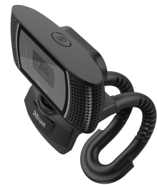
PRODUCT EXTRA 1