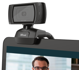
PRODUCT VISUAL 3