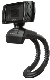
PRODUCT VISUAL 1