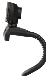
PRODUCT SIDE 1