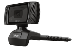
PRODUCT VISUAL 2