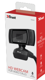
PACKAGE VISUAL 1