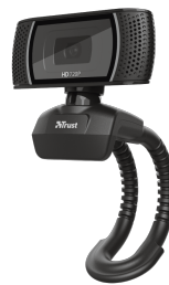
PRODUCT VISUAL 4