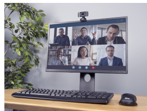
LIFESTYLE VISUAL 1