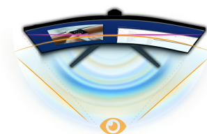
CURVED DESIGN 1500R

Ultra-wide 32:9 monitors with a DQHD 5120x1440 resolution, also called dual QHD, deliver razor-sharp images. They make it possible to divide the workspace into multiple windows and simultaneously open all the documents you need.