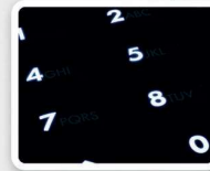
Backlit keypad turned On

The TAA-compliant drive is available in capacities of up to 16TB and redefines the standard for securing data with ease and confidence.